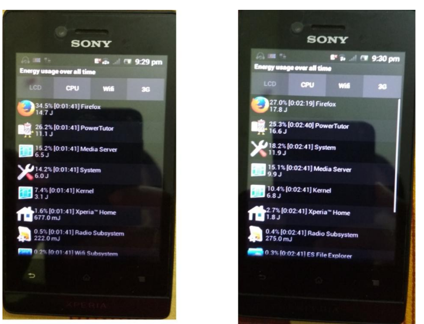
Fig 5. Power Optimized Result