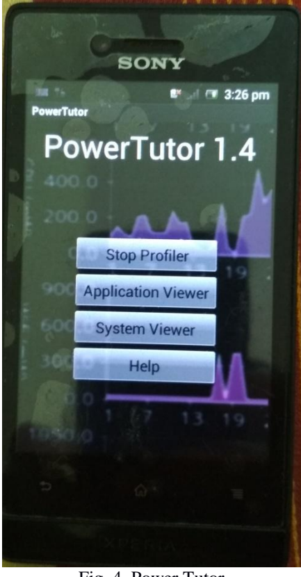
Fig 4. Power Tutor

Fig. 4 shows the Power Tutor Application on the mobile environment for calculating the power consumed by the application on the phone and the cloud.